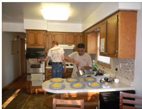
Figure 1. Health values. This photo was taken by an individual with I/DD describing how informal CBHPI, such as staff teaching people with I/DD how to make their own meals has supported healthy eating habits, resulting in less fast food being consumed. The photo was captioned as “Making our own dinners and lunches to take to workshop.”