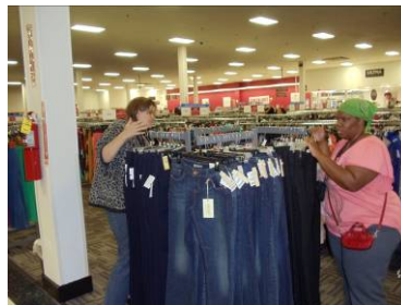
Figure 3. Peer support. This photo was taken by an individual with I/DD and represents how people with I/DD value the support they receive from their peers when out in the community. This photo was captioned as “We stick together and help each other when at the store.”

paying for items at the store, supporting older people with I/DD who may need to take a break from walking, and sticking together so they do not get lost. People with I/DD talked about how engaging in CBHPI is easier when everyone gets along and everyone wants to participate in the activity (TABLE VII: Quote #21). Disagreement over a community activity or meal often resulted in frustration and poor execution of CBHPI (TABLE VII: Quote #22). This finding was also confirmed by observations that people with I/DD were enthusiastic to support each other around the house and when out in the community direct support staff felt that CBHPI should focus more on peer mentoring to improve the likelihood of sustainability, as a means to cope with staff turnover (TABLE VII: Quote #23).