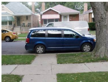
Figure 2. Resources. This photo was taken by an individual with I/DD to depict how having access to a van made it much easier for the group home to plan community activities, such as going to the bank or to the mall. This photo was captioned as “Van makes it easy to get places.”

Because of the lack of structured action plans, direct support staff had to utilize their own personal knowledge and creativity to support healthy lifestyles and community engagement for people with I/DD, regardless of barriers they encountered (TABLE IV: Quote #10). For example, transportation was identified by management, direct support staff and people with I/DD as both a support and barrier for sustaining CBHPI. Having a van at each group home made planning community outings a lot easier (TABLE IV: Quote #11; Figure 2). However, group homes who did not have their own van had to plan activity days in advance so they could secure transportation. In some cases, both management and direct support staff were willing to take people with I/DD in their own cars so that people with I/DD could participate in the community. If transportation was not available, direct support staff had to plan activities within walking distance so that people with I/DD could still be involved in their communities. These findings were confirmed by observation. Management and staff talked about how agencies need to keep transportation in mind when they are developing CBHPI for people with I/DD.