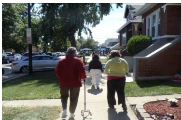
Figure 4. Aging with I/DD. This photo was taken by an individual with I/DD and depicts how older house mates find it difficult to keep up with younger house mates when they are out in the community due to age related health issues, such as becoming tired quicker and not being able to walk as far due to arthritic pain. This photo was captioned as “Getting older. We get tired when walking.”