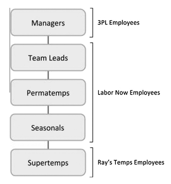
Fig. 2. Intra-agency worker hierarchy.

The next three categories are particularly illustrative of the gradient: what the workers themselves call "perms," which are permatemps; "seasonals" hired on for a two or three month high-volume period; and what are commonly known as the "tempiest" or "super-temps," episodic workers subcontracted by yet another temp agency and brought in on an hourly or daily basis. The actual job tasks performed under these three different categories were largely the same, though permatemps were more likely to be in the shipping and receiving department, where there is an element of goods storage, versus "flow," which entails unloading goods from a container and immediately loading it onto