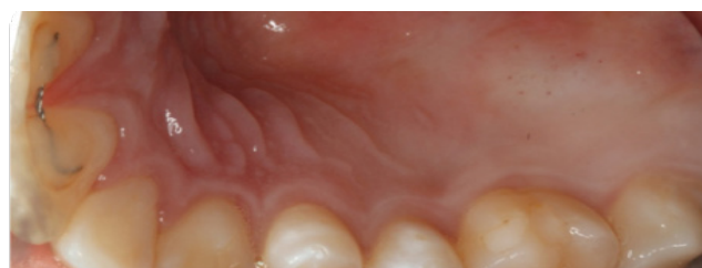
Figure (4B). Connective tissue donor site