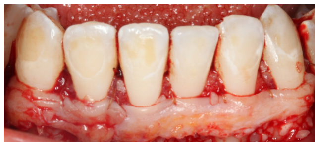
Figure (6). SECT sutured at recipient site