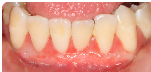
Figure (10). Four weeks post op