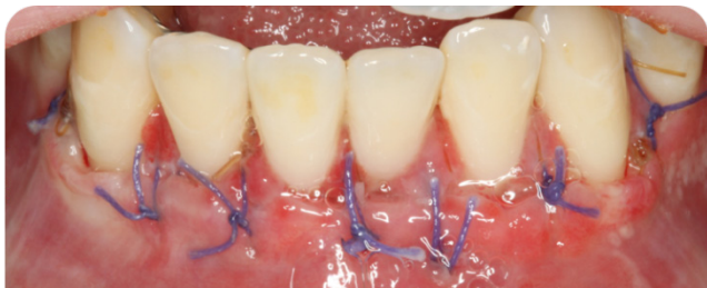
Figure (8). One week post op

The patient was followed up for a year and was receiving periodic maintenances, the surgical area was observed and the results were stable.