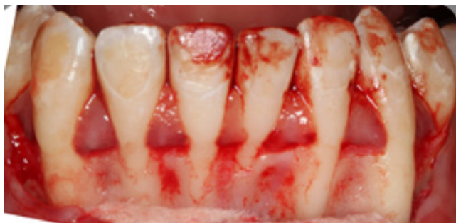
Figure (2). Full thickness flap

premolar. The papillae were kept intact. A full mucoperiosteal flap was reflected to access the defect [20]. Upon entry, dehiscences were seen on all the teeth. The lower left canine showed the largest labial dehiscence extending to the apical third of the root. The lower left lateral also exhibited a large defect extending to the apical third of the root. The defects on lower central incisors and lower right lateral incisor extended 2-4 mm apically from the CEJ. The lower right canine also exhibited a significant dehiscence extending to the apical third of the root. Figure (2).