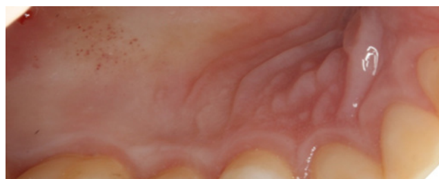
Figure (4A). Connective tissue donor site

was repositioned at the level of the cemento-enamel junction and single interrupted Vicryl sutures were placed. Figure (7).