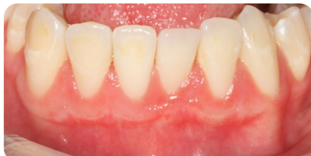
Figure (11). Six months post