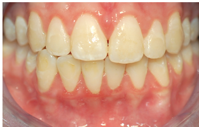
Figure (1). Pre-operative

A comprehensive periodontal exam was performed on the patient. Oral hygiene was determined to be fair with an O'Leary's Plaque index of 17%. Periodontal probing depths ranged from 2 to 3 mm with no mobility in the mandibular anterior region. The mucosa overlying the labial surfaces of the lower anterior teeth appeared to be thin. The patient's gingival tissue biotype was classified as a thin-scalloped type or thin biotype [14]. Prominent roots were observable with no gingival recession noted. A zone of attached and keratinized gingiva of 1 mm in height throughout the labial aspect of the anterior region was noted. Figure (1) the outlines of the roots were clearly evident and prominent concavities were seen between the roots. Radiographic examination of the area revealed no apparent interproximal bone loss.