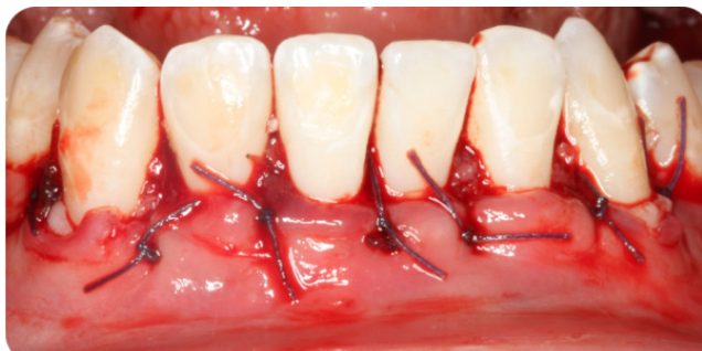
Figure (7). Flap repositioned

Periodontal dressing (Coe-Pak) was placed over the flap interlocking in the interproximal areas [27, 28]. The patient was prescribed Amoxicillin 500mg (tid for seven days), Ibuprofen 800mg (tid for seven days) and 0.12% Chlorhexidine rinse (bid for 30 s for 7 seven days) for post-operative use. Verbal and written postoperative instructions were given.