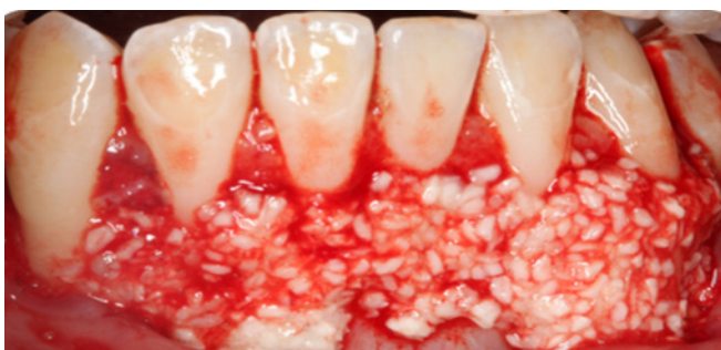
Figure (3). Grafting using FDBA and EMD

A 0.25 mm round carbide bur was used in high speed with copious irrigation for decortication of the labial cortical plate at multiple sites. Freeze dried bone allograft (FDBA) material was used for the grafting procedure. The graft material was hydrated with enamel matrix protein derivative (EMD). The EMD was also applied to the root surfaces and the bone graft material was placed over the root surfaces Figure (3)[21-26]