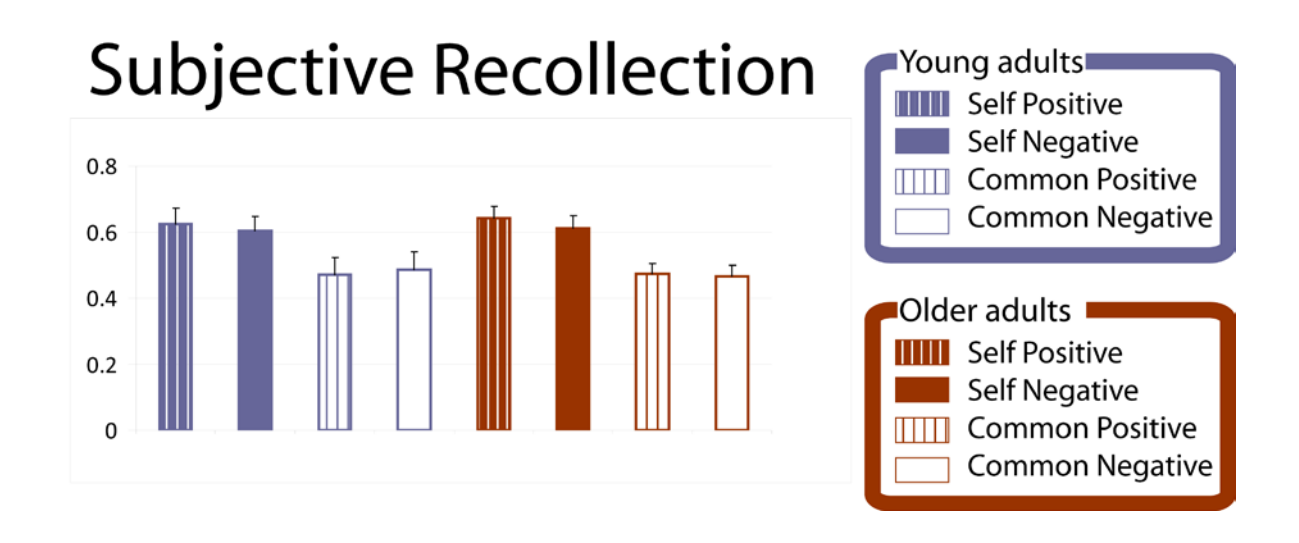
Figure 2. Behavioral effects are depicted for each age group for subjective recollection estimates in Experiment 2, as a function of age, condition, and valence. Subjective recollection estimates are plotted on the Y-Axis. Error bars represent the standard error of the mean.