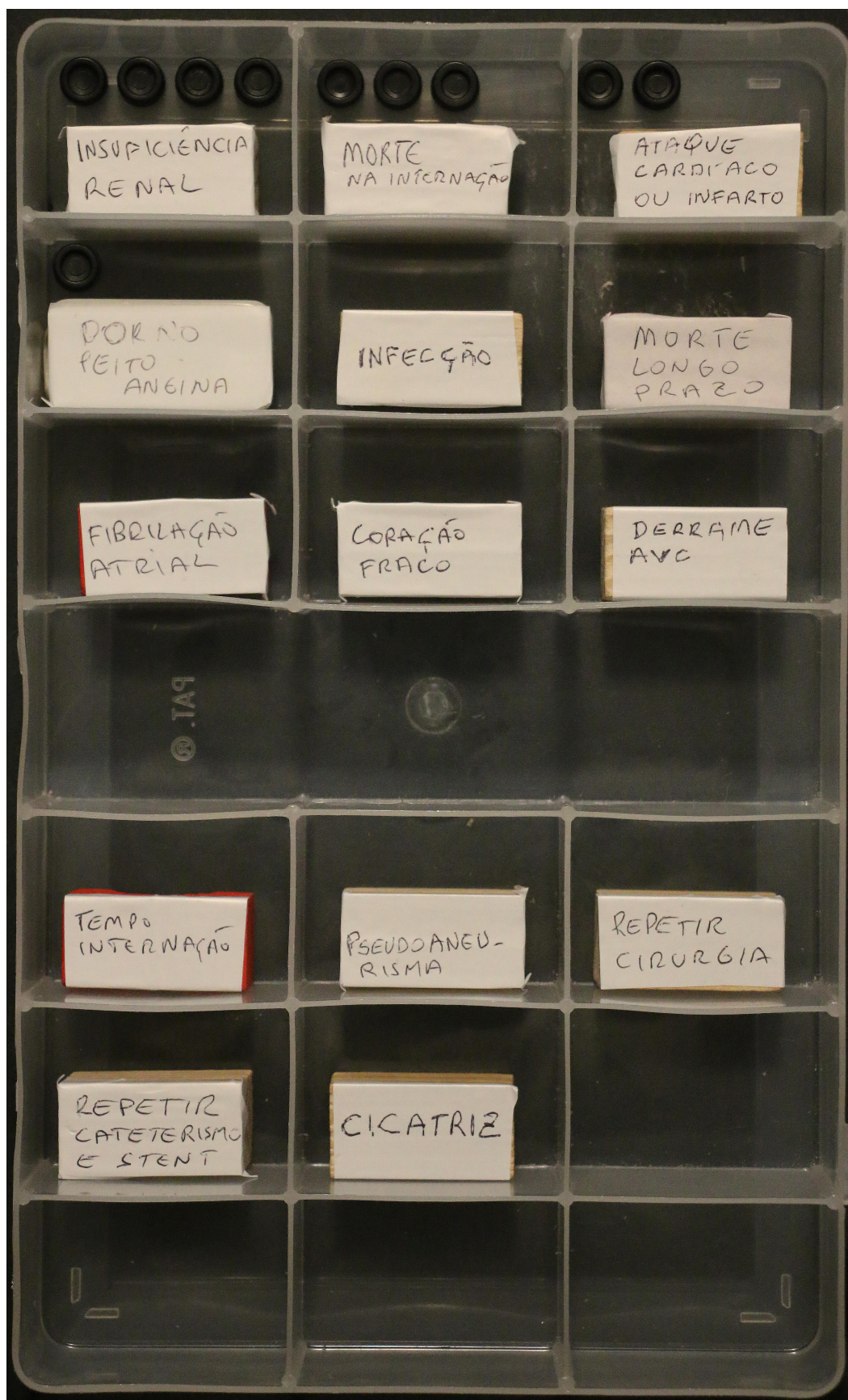
Figure 1 The dotmocracy rating method.