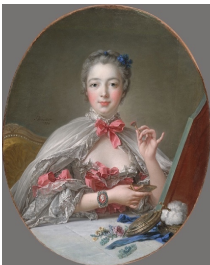
Figure 5: François Boucher, Madame du Pompadour at her Toilette , 1758 (public domain)