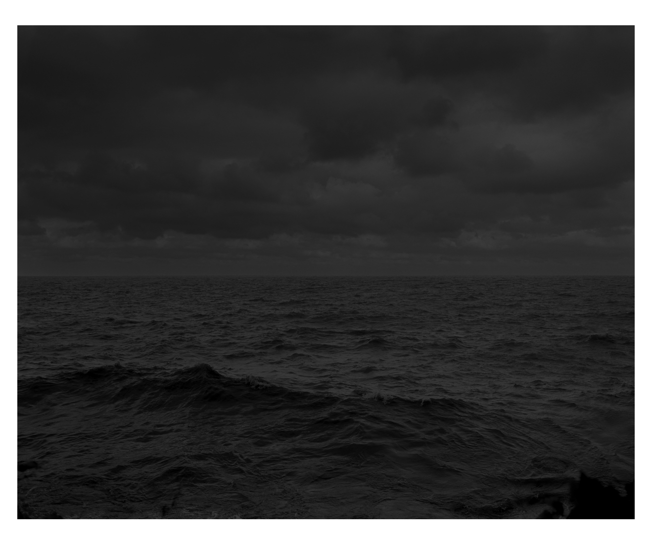
fig. 8 Dawoud Bey, Night Coming Tenderly, Black: Untitled #25 (Lake Erie and Sky) , 2017 Gelatin silver print, 44 by 55 in