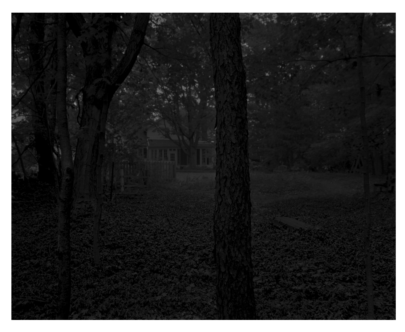
fig. 5 Dawoud Bey, Night Coming Tenderly, Black: Untitled #2 (Trees and Farmhouse) , 2017 Gelatin silver print, 44 by 55 in