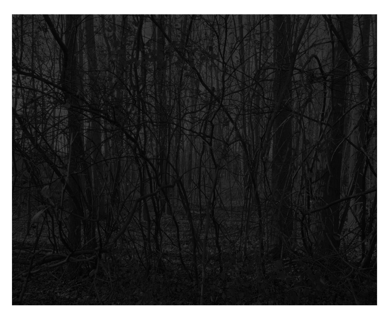
fig. 4 Dawoud Bey, Night Coming Tenderly, Black: Untitled #17 (Forest) , 2017 Gelatin silver print, 44 by 55 in