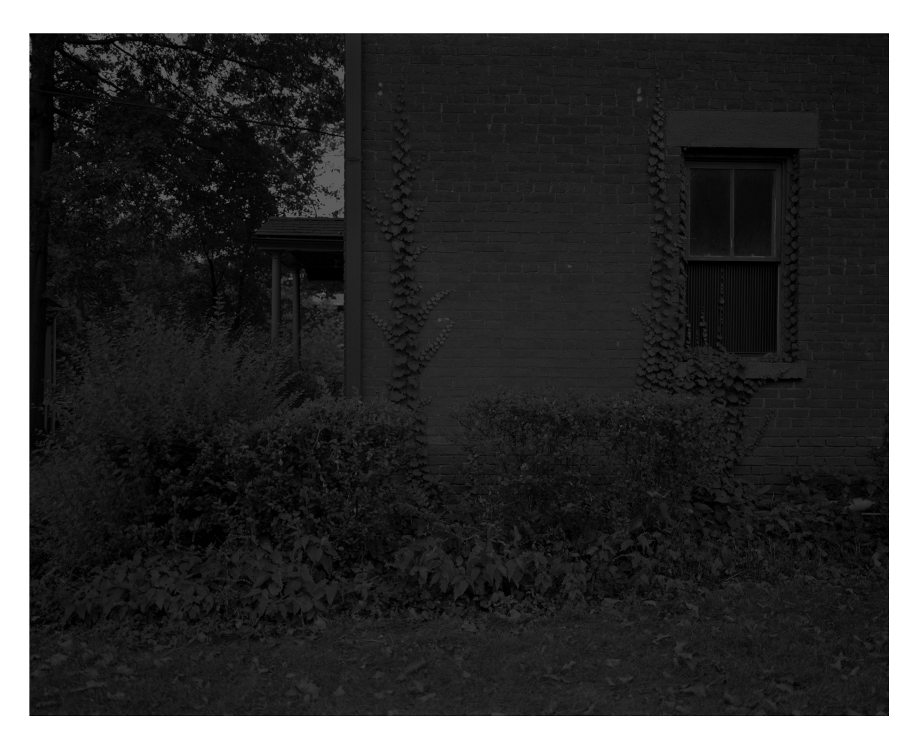
fig. 3 Dawoud Bey, Night Coming Tenderly, Black: Untitled #3 (Cozad-Bates House) , 2017 Gelatin silver print, 44 by 55 in