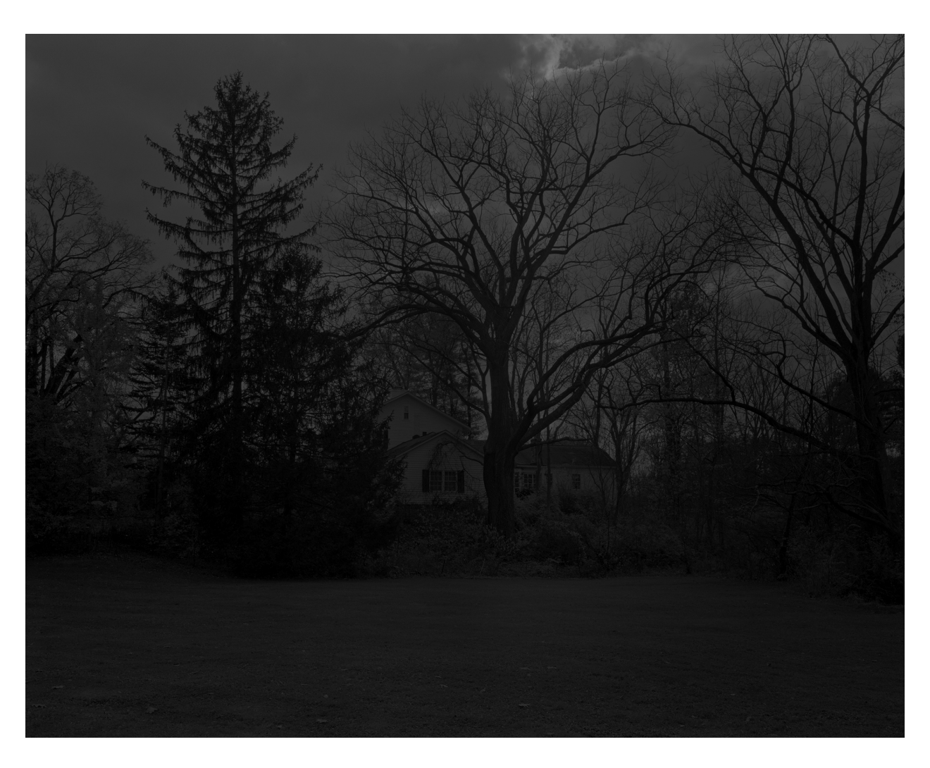
fig. 2 Dawoud Bey, Night Coming Tenderly, Black: Untitled #14 (Site of John Brown's Tannery) , 2017 Gelatin silver print, 44 by 55 in