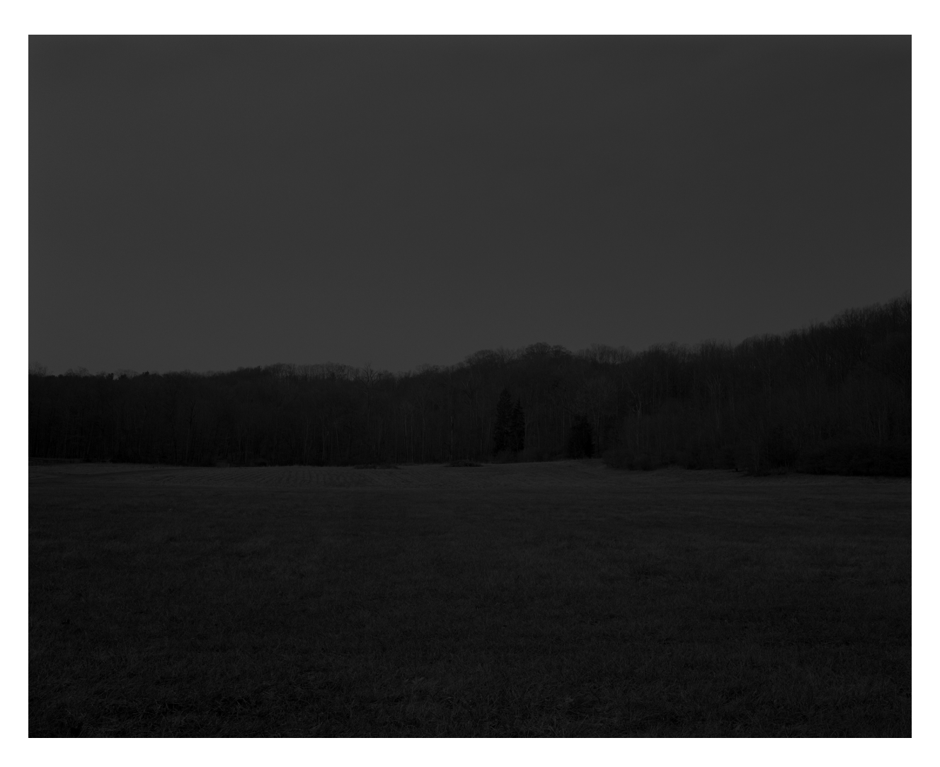
fig. 6 Dawoud Bey, Night Coming Tenderly, Black: Untitled #9 (The Field) , 2017 Gelatin silver print, 44 by 55 in