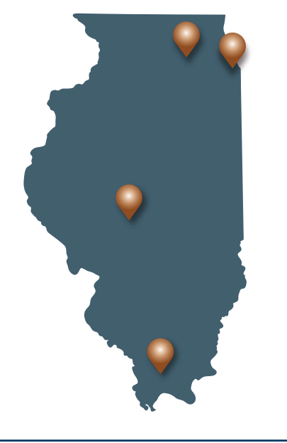
Figure 2: Location of teachers in the study

to more than 17 years in grade levels from early elementary through high school. The 15 educators represent the diversity of communities and teaching contexts found in the major regions of Illinois. Figure 2 indicates their geographical distribution throughout the state.