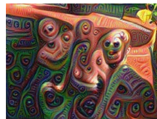
Figure 1: A late-stage DeepDream processed photograph of three men in a pool. Deep_Dreamscope_(19822170718).jpg

research in computational music composition during the 1950s and 60s reveals a compelling historical pretext to contemporary machine learning experimentation. [1] These early stochastic music compositions, painstakingly programmed on supercomputers ill-fitted for musical experimentation, were the result of two converging post-World War II phenomena: the first involved the sudden exuberance toward interdisciplinary art and technology experiments, an aftereffect of wartime scientific guilt. Many of these collaborations were the result of the interdisciplinary nature of computing centers within research institutions before the onset of recent disciplinary rigidity.