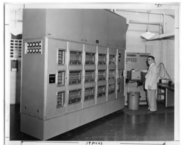
Figure 4: The ILLIAC circa 1952.

Many later descriptions summarize the Illiac Suite programming process as an attempt to simplify music composition by automating decisions conventionally made by the composer. For example, composer Gerald Strang’s analysis of the Suite in the 1969 Cybernetic Serendipity exhibition catalog suggests the process was solely an intermediary phase as Hiller explored options in automating music composition; he describes the Illiac Suite solely as a first step toward Hiller’s most well-known contribution to computer music, the assistive compositional software/programming language MUSICOMP (MUSIC Simulator-Interpreter for COMpositional Procedures) (Reichardt, 1969, p. 26).