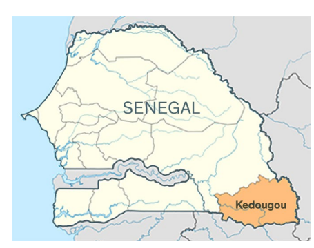
Partnership Research Site in Kedougou Region

Senegal, a lowto-middle-income country (LMIC) in West Africa, ranks 15th in incidence of cervical cancer worldwide with 4.43 million women aged 15 years and older at risk for disease development.1 It is