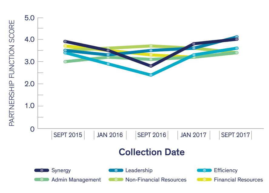
FIGURE 2 GHCP* Partners' views on partnership function factors over time